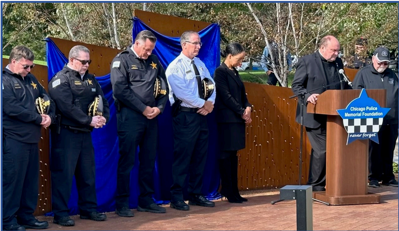
On 11 OCT, we dedicated a new memorial sculpture at Gold Star Families Memorial and Park, honoring CPD's beloved fallen canine and equine members.